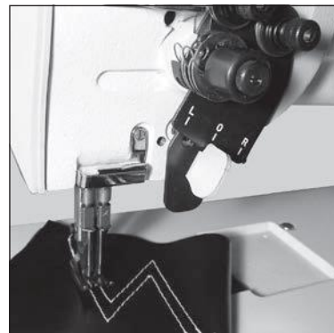
Angular stitching and/or straight stitching can be made by simplified operation