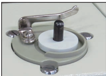
Built-in bobbin winder