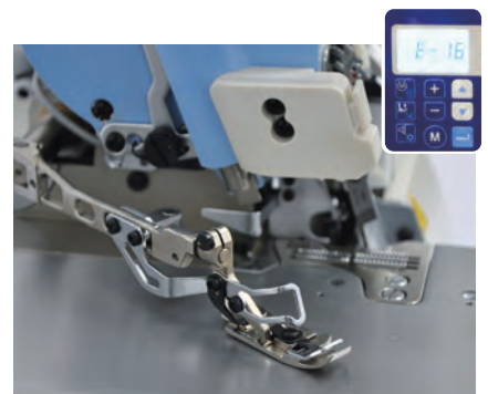
3. Presser foot arm with an open/close sensor