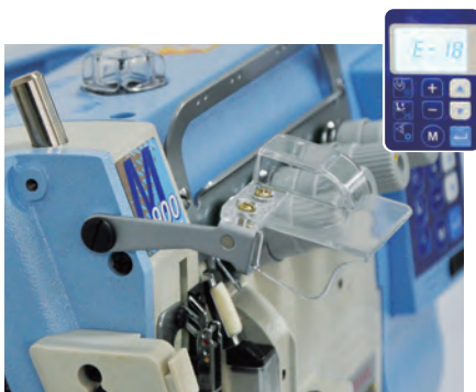
1. Eye guard with an open/close sensor

The cover sensor unit and cover microswitch unit that detect 1, 2 and 3 (shown below) are closed tightly during sewing, thereby preventing the sewing machine from starting up unexpectedly.