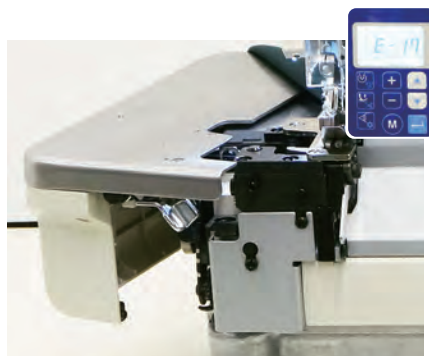
2. Cloth plate cover with an open/close microswitch